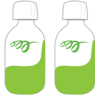
Two bottles of CLENPIQ (5.4 oz each)